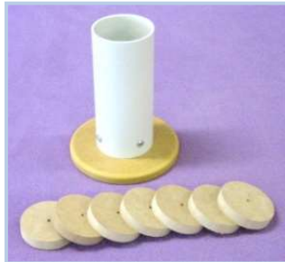
Prod ID: RE1004.2 (100 mm)