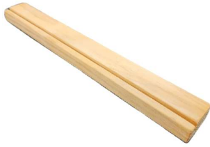
Prod ID: RE2002.4 (Straight)