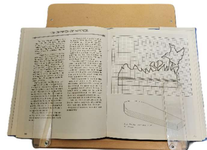
Prod ID: RE1009.3 (Lightweight Model)