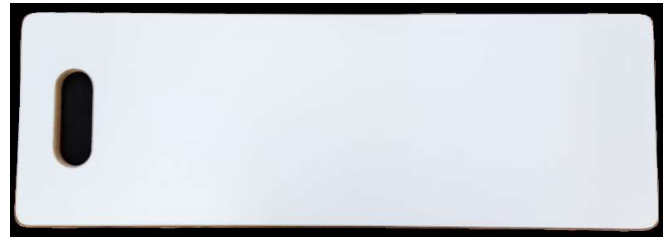
Prod ID: RE1010.4 (700 mm)