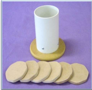
Prod ID: RE1004.1 (65 mm)