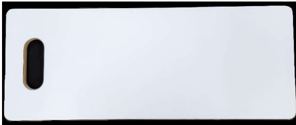
Prod ID: RE1010.3 (600 mm)