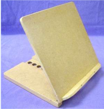
Prod ID: RE1009.1 (Small)