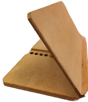
Prod ID: RE1009.2 (Large)