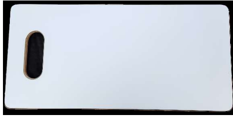
Prod ID: RE1010.2 (500 mm)